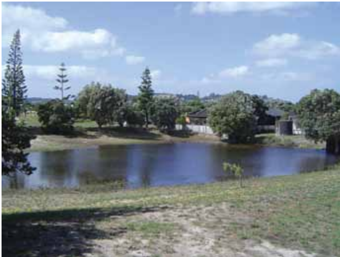
Flooding at Daydawn Reserve.