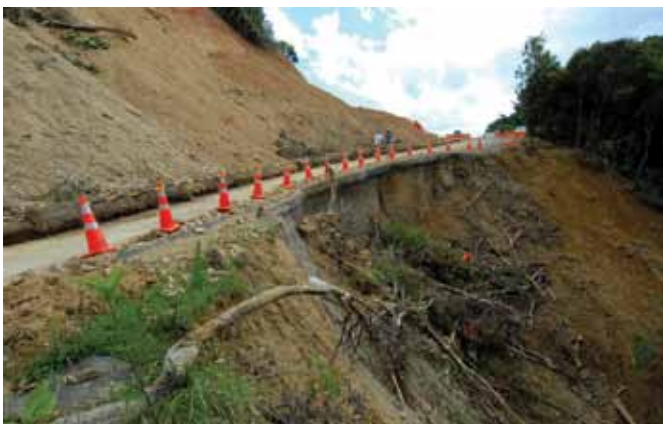
January slip on Matakana Valley Road

Just in case anyone was unaware of the magnitude of the slip on January that closed Matakana Valley Road for nearly 2 months the accompanying picture will give some idea of the size of the damage. Work was delayed pending acquisition of a small block of land needed for the realignment of the new roadway. The roadway should now be open ending the very real problems and access difficulties facing the residents of the road and beyond into the Whangapiro valley.