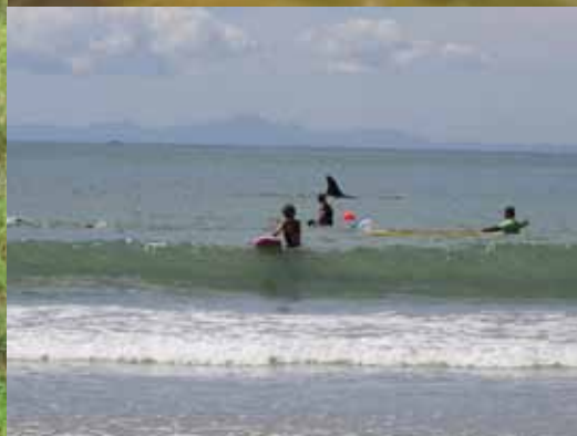
'Send a patrol' – Insite's Chris Martin in deep water. Flooding at the Fire Station. Orcas visit Omaha Beach.