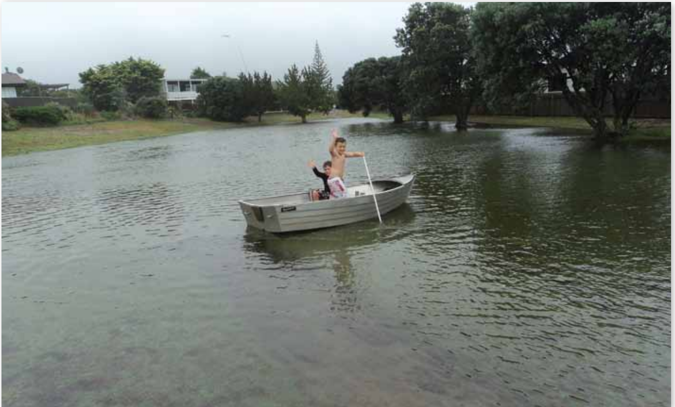
After the rains, January 2011 Walkway 10 Reserve