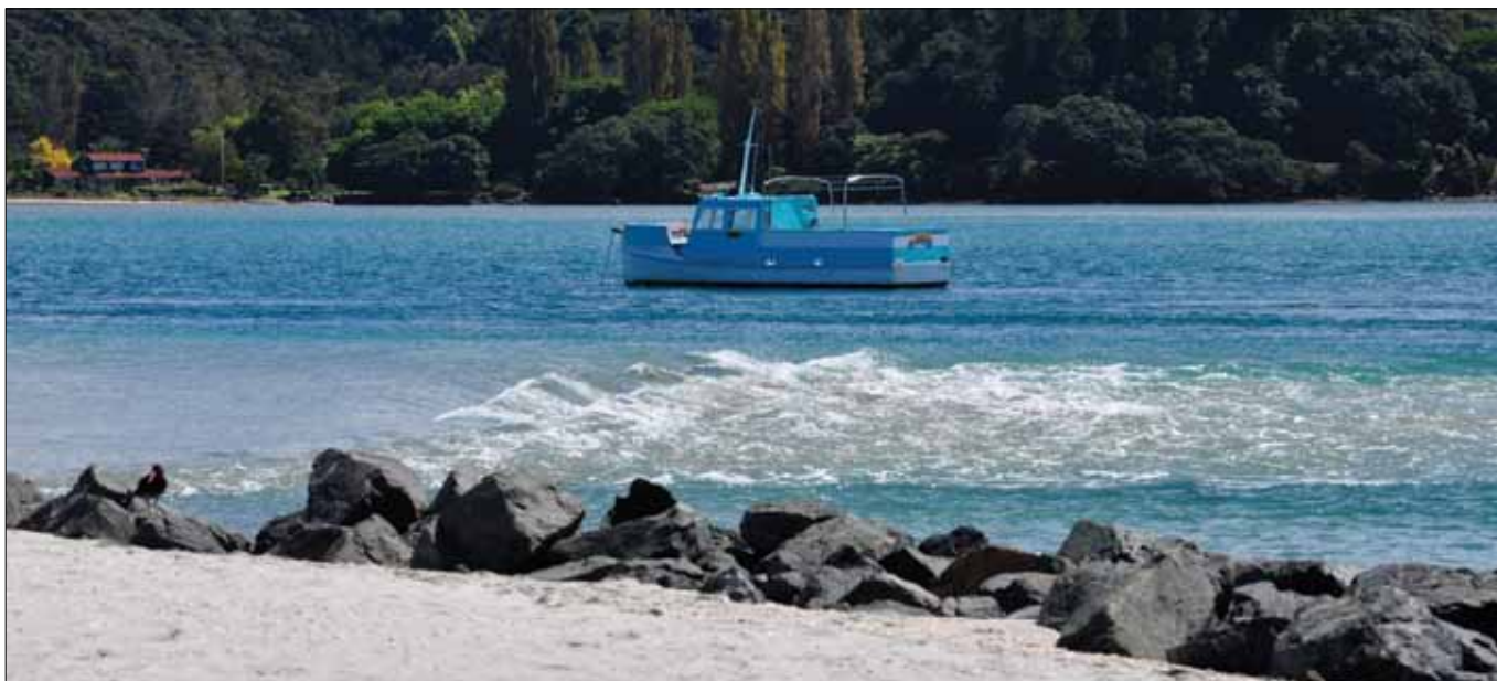
Tsunami surge through harbour entrance.

Another computer model estimated the tidal currents which could be caused by a tsunami. For example a wave originating from an Mw 9.5 earthquake in Chile may cause a run-up of 1 to 2 meters. This would cause tidal currents at the entrance to the Whangateau Harbour and Kawau North Channel of 6 to 8 knots.