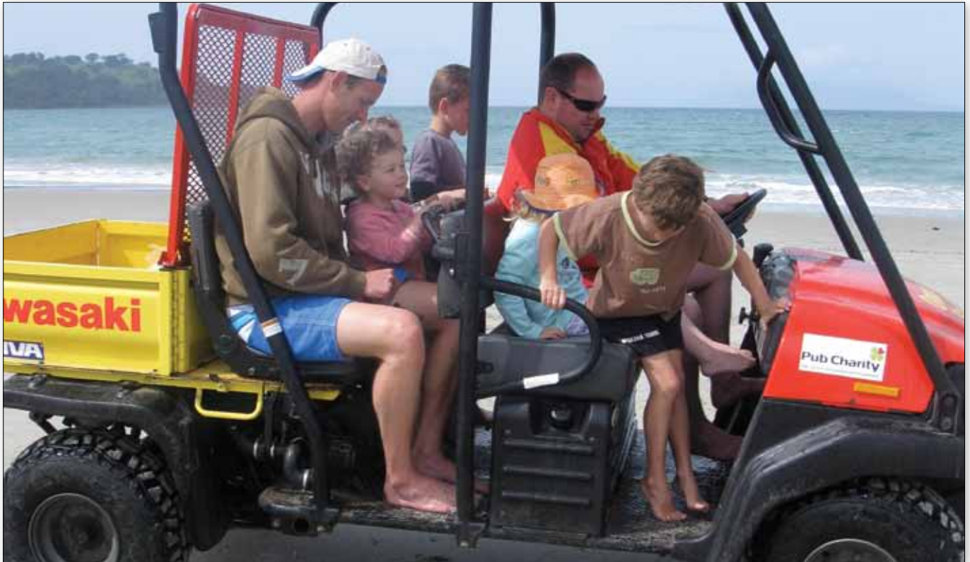
Four wheeler rides for the Juniors at the Omaha Surf Club Registration Day.