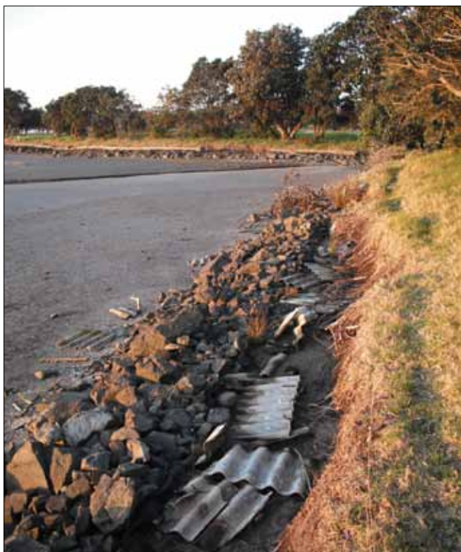
Exposed metal and asbestos as old Seawall breaks up.