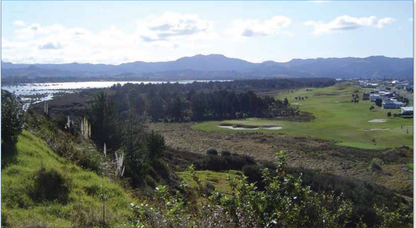
At the top of the Quarry Walk.