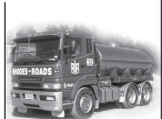
Purpose built 11,000 litre stainless steel tank

NEW WEBSITE ADDRESS www.omahabeach.co.nz