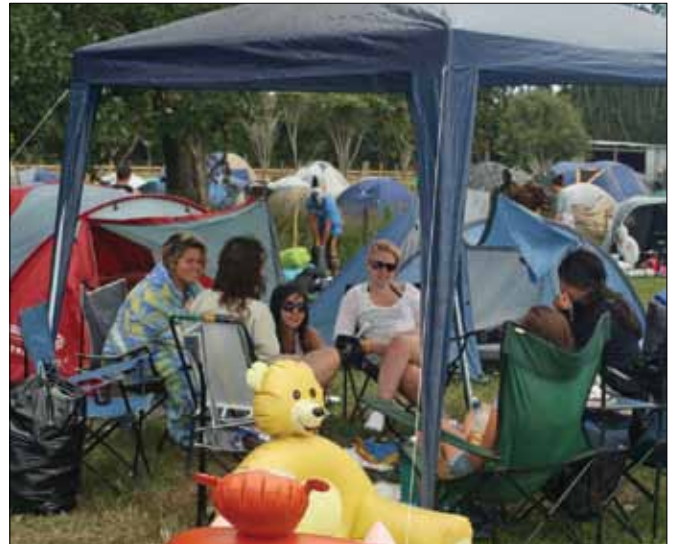
Campers at the last New Year event.

This is to be held at the Matakana Country Park from 4.00pm Saturday 31 December to 4.00am New Years Day. An impressive number of artists are expected, playing 4 stages, with other attractions including an air show and a fireworks display. The Golf Club are organising the campground across the estuary as they did in 2010 and a large crowd is expected. Camp lots are available for 1 and 3 nights.